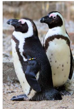
African Black-Footed Penguin